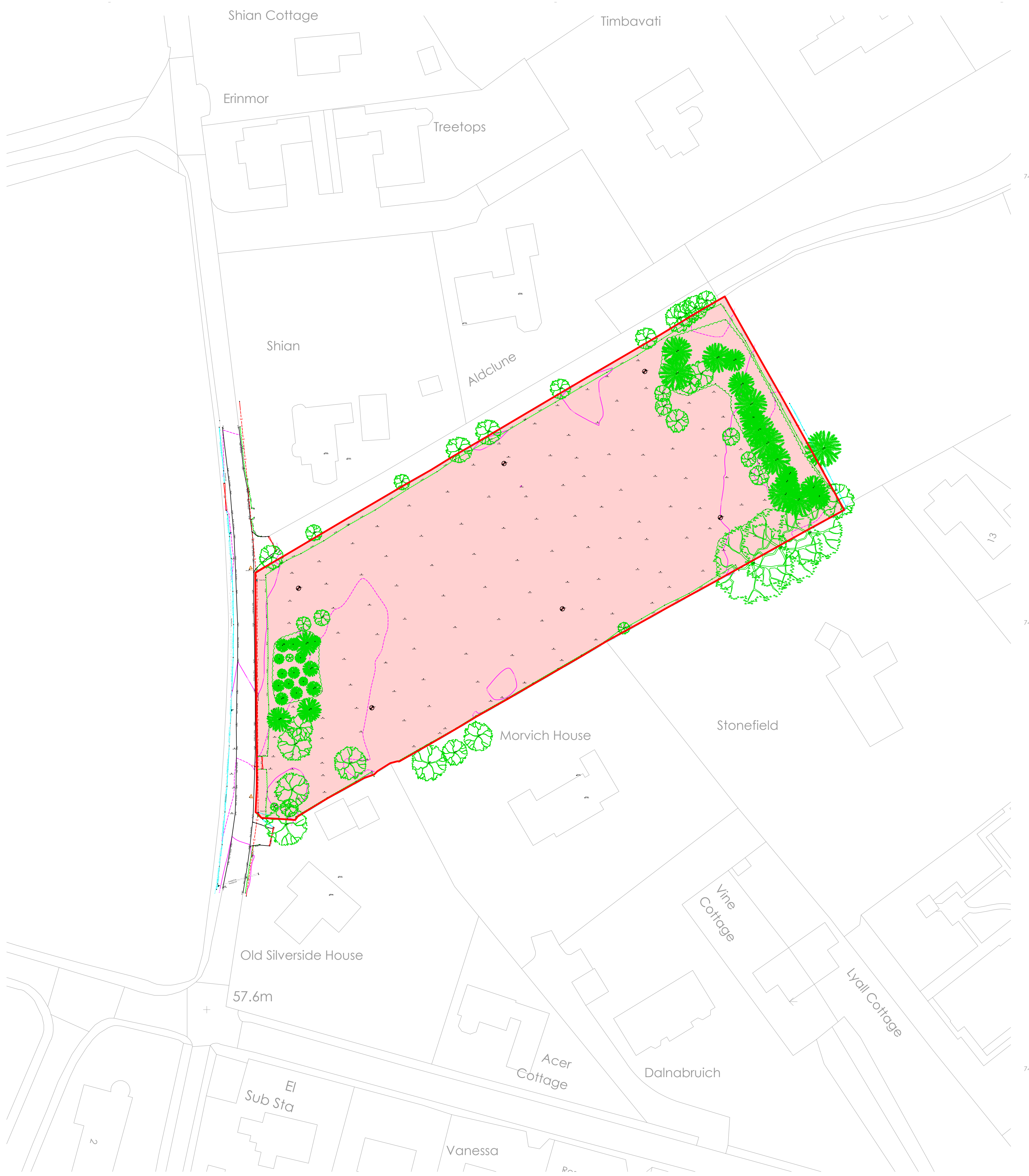
Existing Site Plan (1:500)